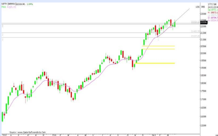
NIFTY WEEKLY CHART

As we saw the Price Movement in Nifty fut in last week that In Upside is 23623.00 and in Downside 22846.00.