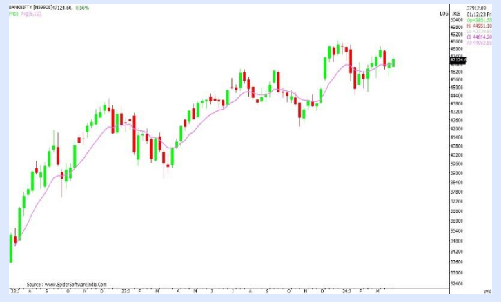
BANKNIFTY WEEKLY CHART